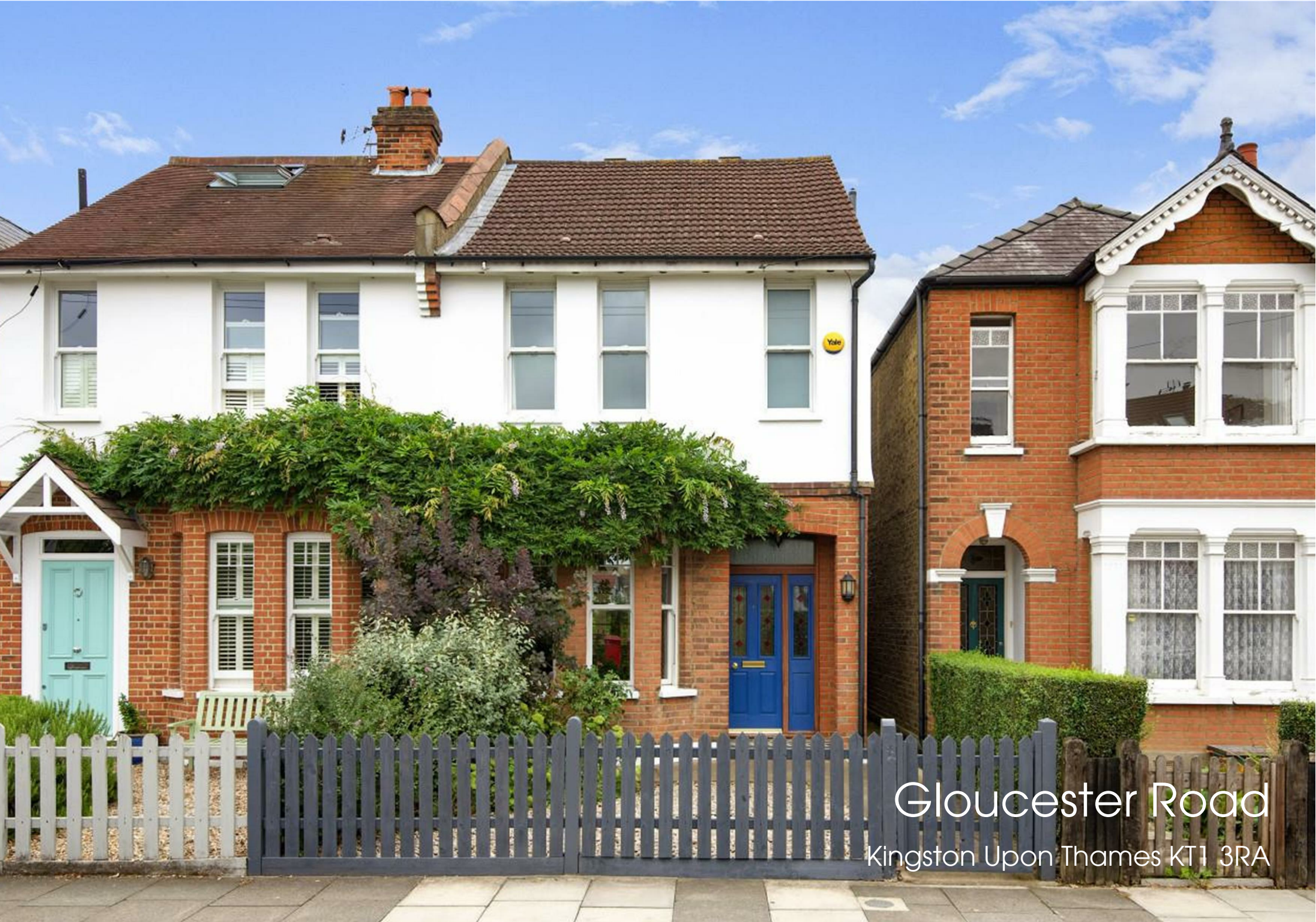
Gloucester Road Kingston Upon Thames KT1 3RA